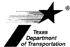
EXHIBIT A Economically Disadvantaged Counties FY 2020